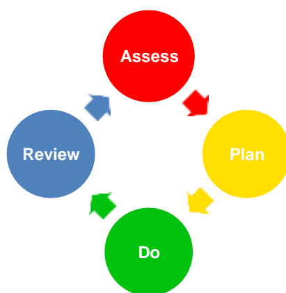
Figure 1: The four-part cycle that underpins The Graduated Approach