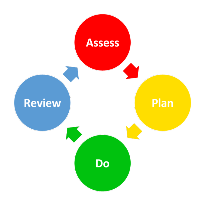
Figure 1: The Graduated Approach

Initial assessments begin with a shared discussion and decision on desired outcomes, expected progress and attainment. Part of this stage is discussing aspects such as attendance, health and welfare (including hearing and sight) or changes in family situations to see if there is a reason, other than SEND, which is preventing a child from making good progress. If there are extenuating circumstances as to why the child has not made adequate progress, these will be appropriately addressed, such as through a referral for an Early Help Assessment.